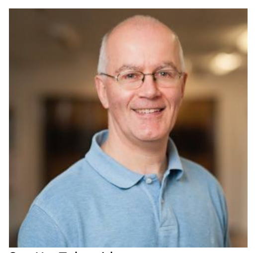
See YouTube video: <a href="https://youtu.be/-yyusmxizQk">https://youtu.be/-yyusmxizQk</a>

We need to raise £1.6 million to run a four to five year project with a target of £150,000 by the end of 2020 to allow us to start. I announced the project at the UK CMRC Bristol meeting where I talked about our recent work.